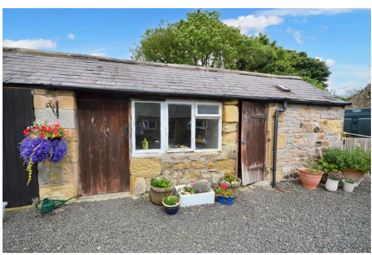
Approx Gross Internal Area