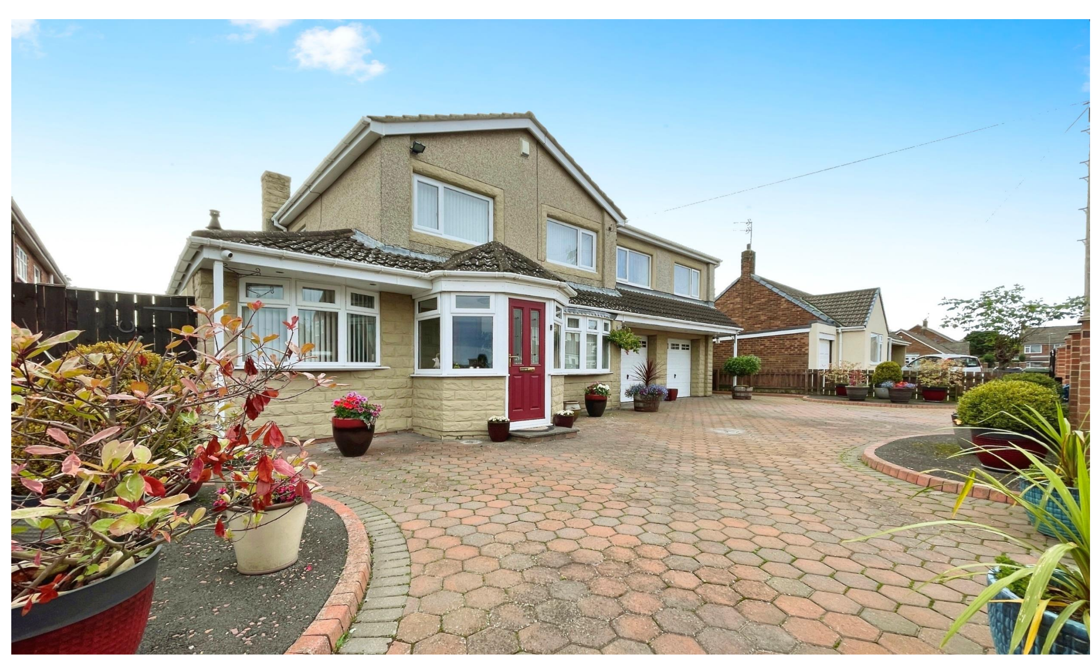
Hotspur Avenue Bedlington