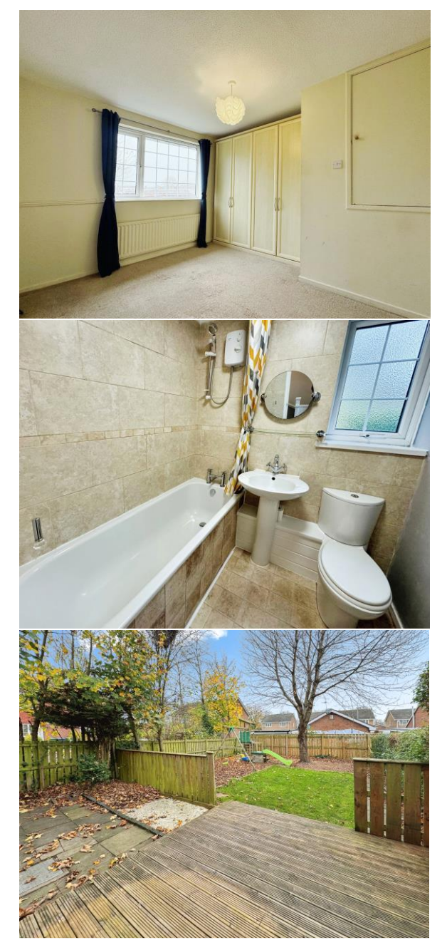
Epc will go here

Important Note: Rook Matthews Sayer (RMS) for themselves and for the vendors or lessors of this property, whose agents they are, give notice that these particulars are produced in good faith, are set out as a general guide only and do not constitute part or all of an offer or contract. The measurements indicated are supplied for guidance only and as such must be considered incorrect. Potential buyers are advised to recheck the measurements before committing to any expense. RMS has not tested any apparatus, equipment, fixtures, fittings or services and it is the buyer's interests to check the working condition of any appliances. RMS has not sought to verify the legal title of the property and the buyers must obtain verification from their solicitor. No persons in the employment of RMS has any authority to make or give any representation or warranty whatever in relation to this property.