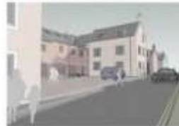
Looking South towards Thorburn Sq.