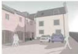
Looking South West within Thorburn Sq.